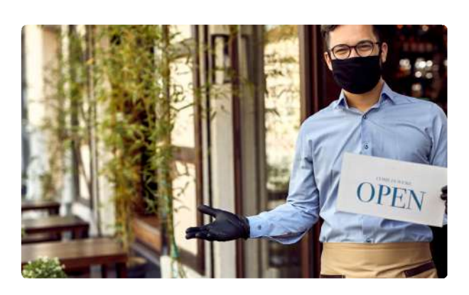
How to Sell Your Services During COVID-19