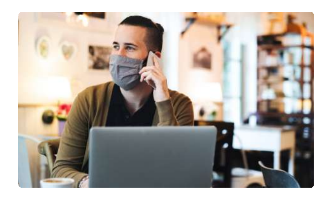
COVID101: How to Follow Up With Customers After Entering Their Homes?